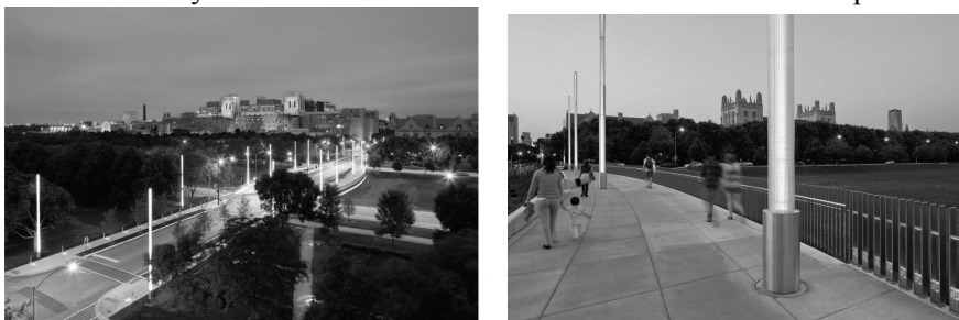
Figure 7. and 8. View of one of three Midway Crossings and detail illustrating how light is revealed as a presence embodied within the functions of the crossings

The mile-long eighty acre Midway Plaisance Park divides the University of Chicago into north and south campuses, resulting in a sense of separation between the two. The Midway Crossings, Figure 7, establish a more coherent and engaging connection between the two areas of the campus by marking the three main cross-Midway streets that now serve as the student vehicular and pedestrian links.