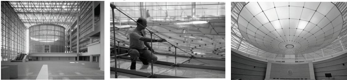
Figure 4. 5. and 6. The Lens Ceiling encloses the cylindrical glass courtroom and is founded on merging performance, structure and light

The spherical area of glass is diffused, creating a luminous sculptural element that captures the sky and the shifting shadows of the building's structure without distracting attention from the proceedings in the courtroom. The various laminated glass panels, provides a thermal, acoustic, and dust barrier for the courtroom space.