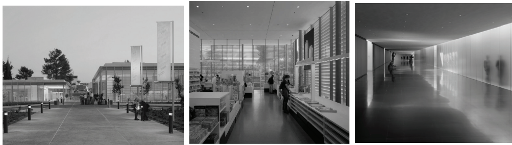
Figure 9. 10. and 11. The all-glass buildings are light instruments deeply connecting visitors to their sequential passage through the museum campus, moderating heat and glare while embodying views and light within the building envelope

The Israel Museum's campus enhancement project, Figure 9, was designed to resonate with the original design vision of Alfred Mansfeld and Dora Gad, infusing light and a clarity of circulation into a built environment that had changed tremendously since its opening in 1965. JCDA designed 95,000 square feet of new construction, including three Entrance Pavilions standing at the front of the campus housing ticketing, restaurant, and retail, a main Gallery Entrance Pavilion providing centralized access to the Museum's main galleries, and a major below-ground Route of Passage that connects the two parts of the campus.