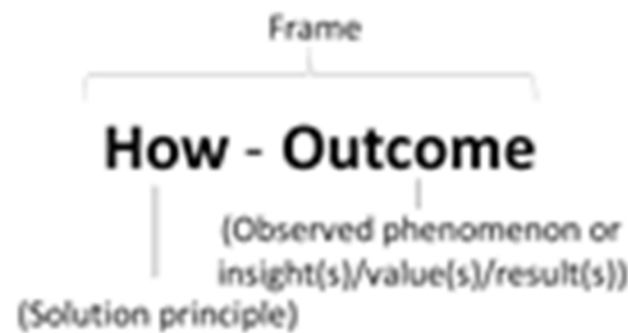
Figure 1. Model adopted from Dorst [2015]

between the deep insights regarding the user and the context-of-use (Outcome) connected with solution principles (How).