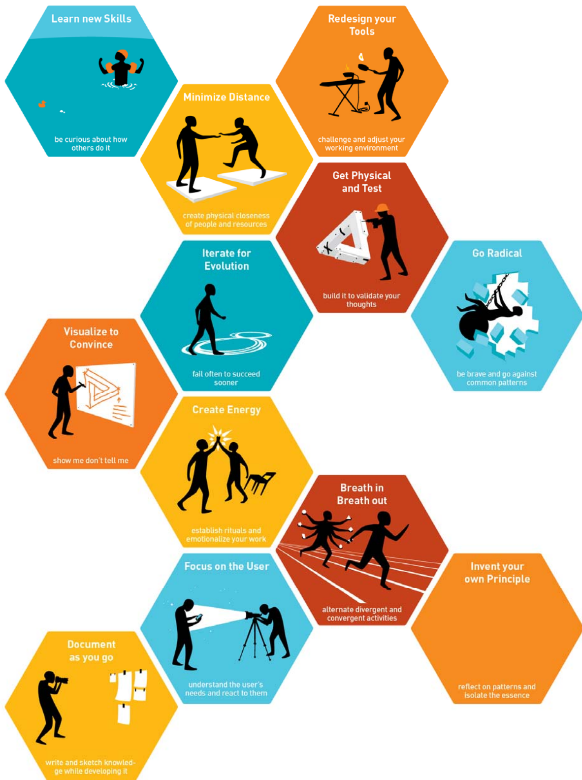
Figure 1. Principles for teams in NPD projects (12 examples)