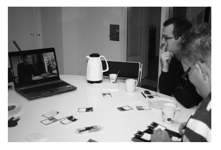
Figure 1. The Video Card Game activity

The workshop took its offset in thematic Video Portraits of the users [7]. The portraits were 8-10 minutes long compositions of video material representing each users experiences regarding his ladder and his prioritizing of values. The value prioritization was composed in a scheme and directly compared to the company's Strategy Canvas (where those two were compatible). While watching these portraits all representatives at the meeting noted interesting or surprising statements or actions of the users on little key word-cards that related to each user by a picture, Figure 1, which was inspired by the Video Card Game originally introduced by Buur & Søndergaard [1]. Afterwards a shared understanding of the problem at hand was developed through categorizing the observations in themes. Finally the themes were divided into three main groups relating to the nature of the themes. The groups in this case represented 'Design challenges', 'Design opportunities' and 'Possible delivery channels'.